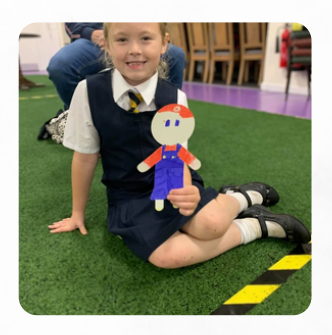
PPA cover for schools