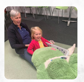
Nursery and preschool classes