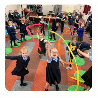
After school community classes