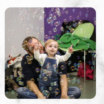
Parent & Baby Community classes