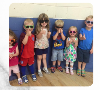
Toddler/ preschool community classes